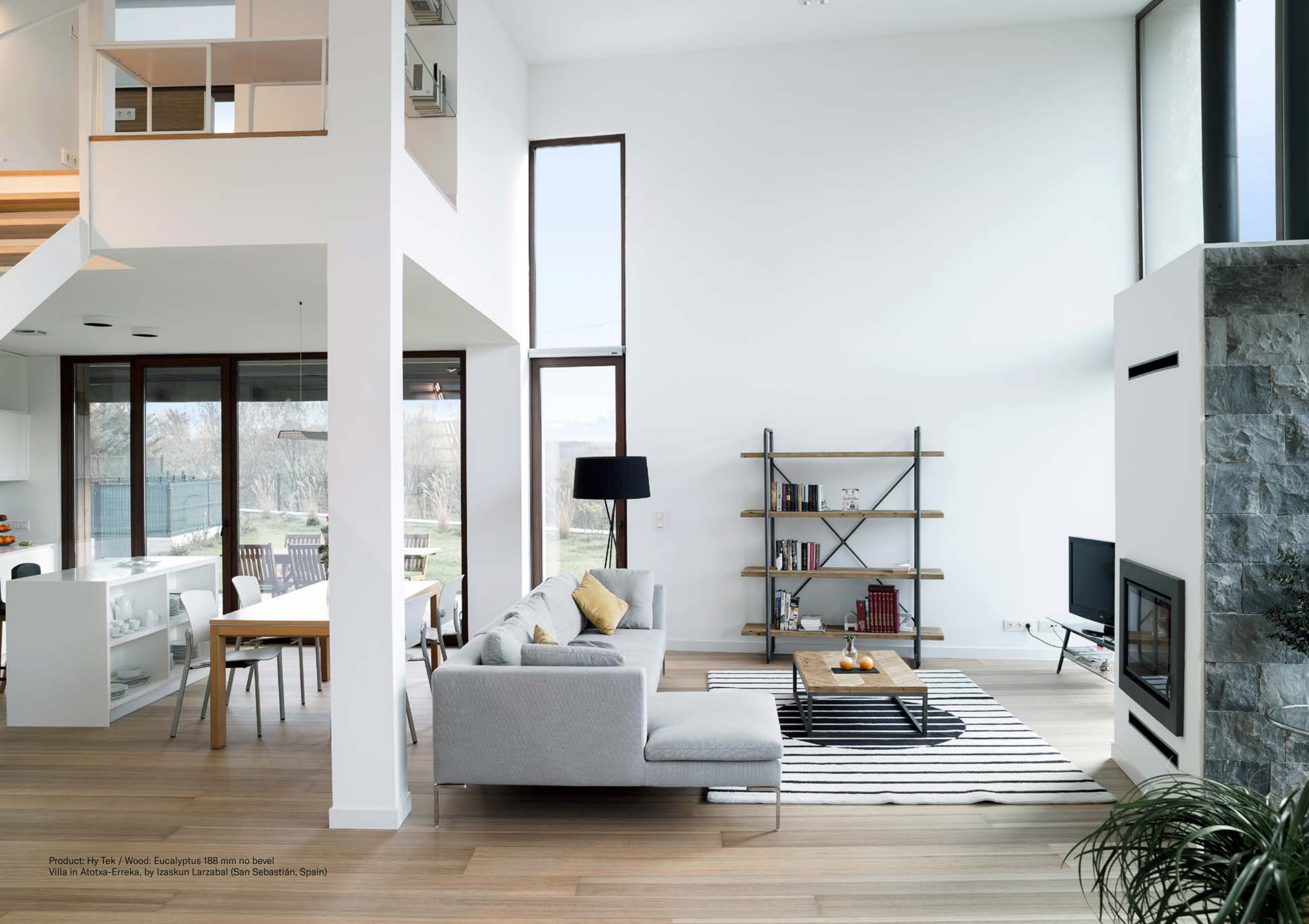
Product: Hy Tek / Wood: Eucalyptus 188 mm no bevel Villa in Atotxa-Erreka, by Izaskun Larzabal (San Sebastián, Spain)